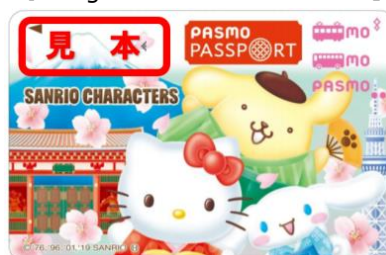
[Design of PASMO PASSPORT]

The following pages provide an overview of the revisions.